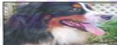
Dog is breathing with nose