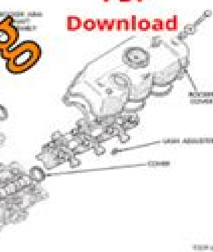
Fig. 2 Rocker Cover