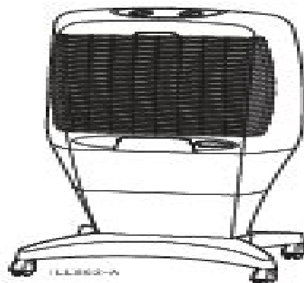
MEGACOOL (MIV, MIVH)