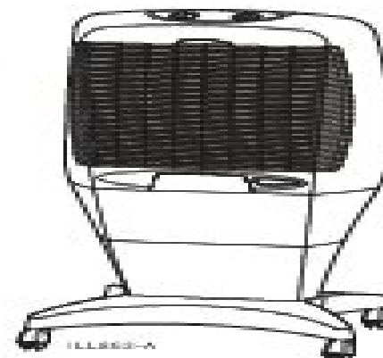
MILLENIA (MI, MIH)