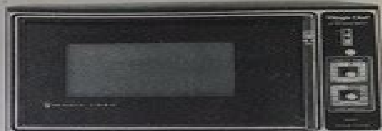
MW300 SERIES MODEL 5P