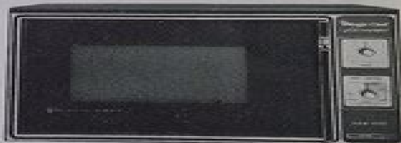
MW400 SERIES MODEL 4