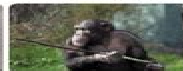
Insight learning (Chimp)