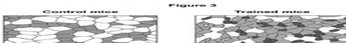
Figure 3 shows a typical set of results they obtained.

Succinic acid dehydrogenase is an enzyme used in the Krebs cycle.