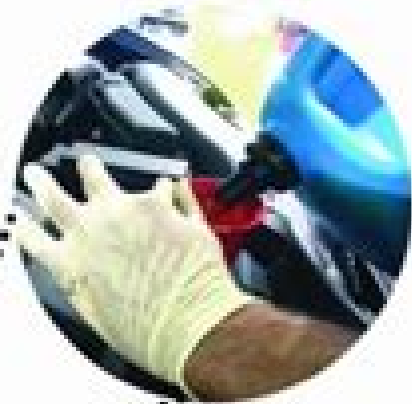
Low on oil