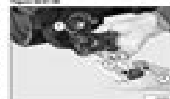
Diagram 1-2: Engine and Fuel System Components