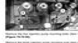
Diagram 1-4: Front Axle and Suspension Components