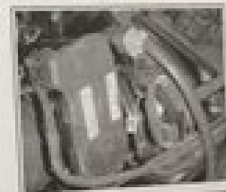
1. KS sensor