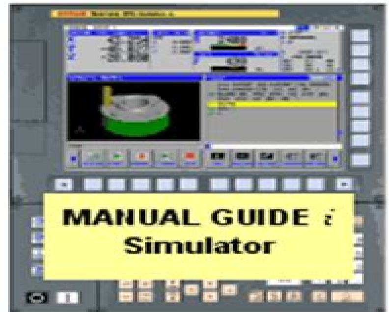
MANUAL GUIDE & Simulator