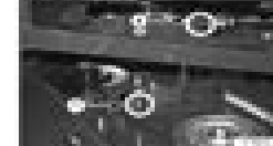
Oil fill and oil drain ports (Figure 000001)

Before the first start-up, please read the safety rules in the operator's manual.