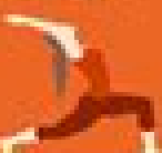
Descender Pose Ardha Padasana