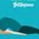
Fish Pose Matsyasana