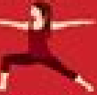
Warrior 1 Pose Virabhadrasana I