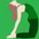
Camel Pose Ushtrasana