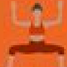
Cocktailer's Pose Ukha Urdhvasana

Sexuality, Relationships, Joy Passions, Jealousy, Creativity