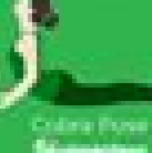
Cobra Pose Bhujangasana