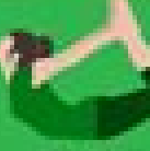
Bow Pose Dhanurasana