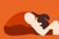
Forward Pose Paschimottasana