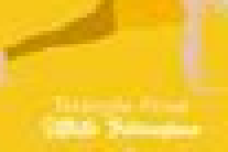
Triangle Pose Ukha Triangasana