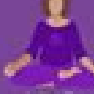
Lotus Pose Padasana