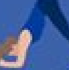
Downward-Facing Dog Adho Mukha Svanasana