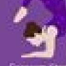
Forearm Stand Parsva Dhanurasana

Consciousness, Unity Spirituality, Oneness