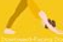
Downward-Facing Dog Adho Mukha Svanasana

Self-Confidence, Power Energy, Transformation