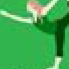
Lord of the Dance Urdhva Dhanurasana

Love, Empathy, Compassion Compassion, Generosity, Trust