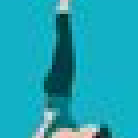
Shoulder Stand Salambasana

Communication, Expression Honesty, Truthfulness