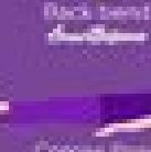
Corpse Pose Savasana