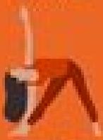
Triangle Pose Ukha Triangasana