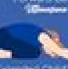
Extended Child's Pose Ukha Padasana