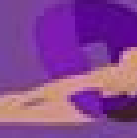
Kababot Pose Salambasana