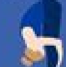
Forward Bend Urdhva Dhanurasana