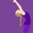
Back Bend Urdhva Dhanurasana