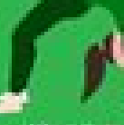
Wheel Pose Urdhva Dhanurasana