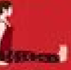
Squat Pose Baddhasana