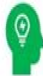
Solutionneur de problème