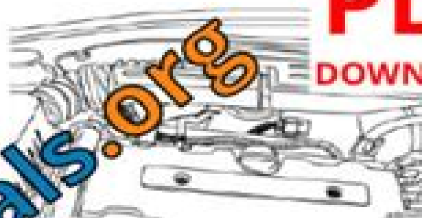
Fig. 30: Identifying Breather Tube To Camshaft Cover (1 Of 2)