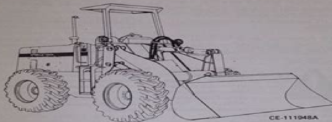
FIG. 1—International 510B Pay Loader