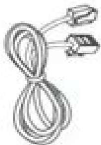
Telephone line cord