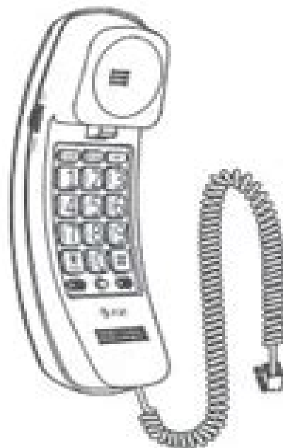
Corded handset with coiled handset cord