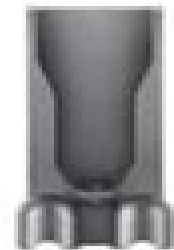
Wall dock and charger