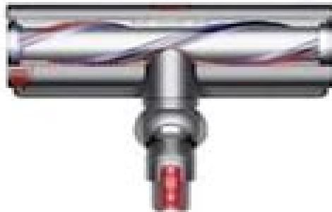
Digital motorbar XL cleaner head