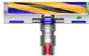
Laser slim fluffy cleaner head