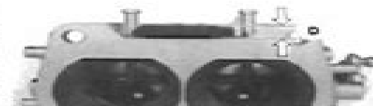
Fig. S218-2—Float height (D) should be 9.5-11.5 mm (0.37-0.45 in.). Bend tang on float arm to adjust.