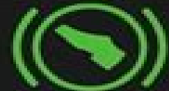
Automatic Shift Lock or Engine Start Indicator Light