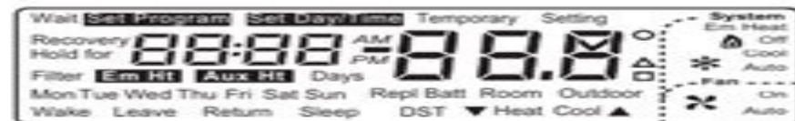
Fig. 11. Display of all LCD segments.