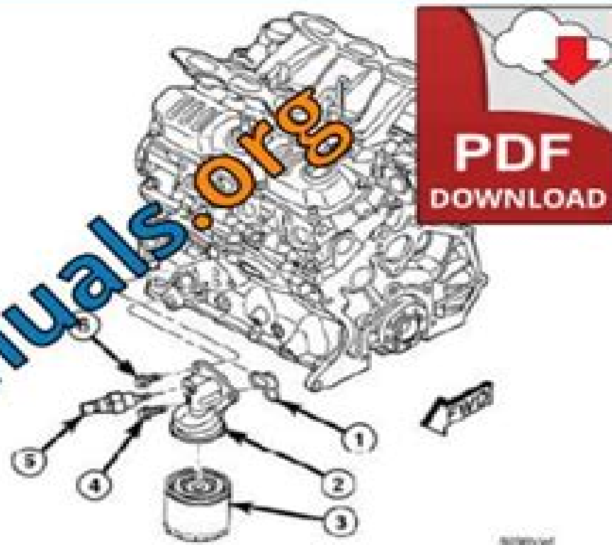
Fig. 156: Removing/Installing Oil Filter Adapter