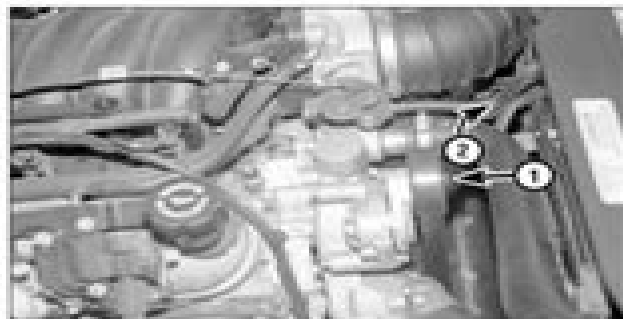
24.11 To remove the drivebelt, rotate the tensioner bolt (1), clockwise (2) to relieve belt tension (2007)