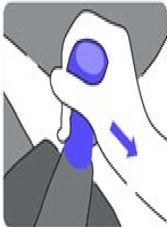
Shift to second