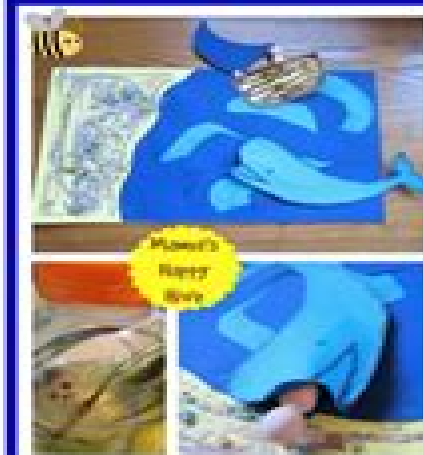
Jonah & the Whale Montessori Style