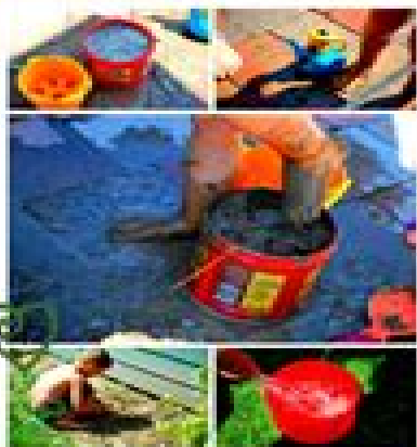
Mud pies and Jesus