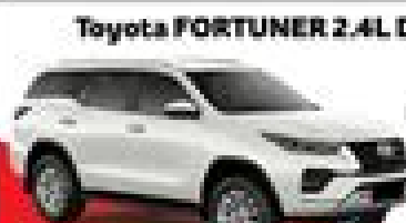
Toyota FORTUNER 2.4L Diesel Automatic 4x4 SUV