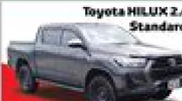
Toyota HILUX 2.4L Automatic 4x4 Standard Spec Double Cab