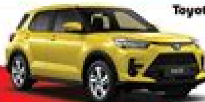
Toyota RAIZE 1.2L 5 Seater