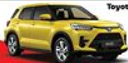
Toyota RAIZE 1.2L 5 Seater