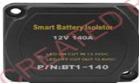
image of the voltage sensing relay i have tested this on my bench psu and it does turn on at 13.3v and off at 12.8v

for those of you making your own cable the plug is a delphi 280 series with 30 amp pins