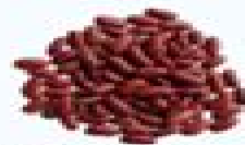
Kidney Beans (Canned)