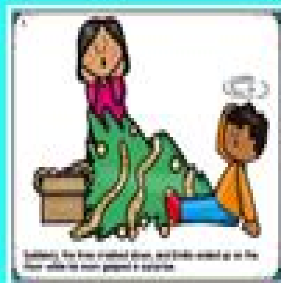
Suddenly, the tree crashed down, and Benji ended up on the floor when the tree landed in a crash.