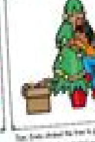
Then, Benji decided the tree is great for what, but the tree started wobbling.