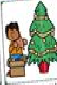
Next, Benji picked a string star for the top of the tree.