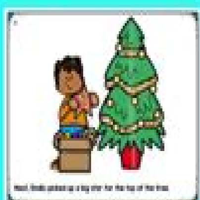
Next, Benji picked up a big star for the top of the tree.