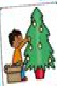
First, Benji put stars and ornaments on the Christmas tree.