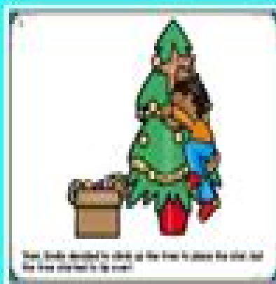
Then, Benji decided to climb up the tree to place the star, but the tree started to tip over.