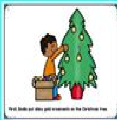
First, Benji put stars and ornaments on the Christmas tree.