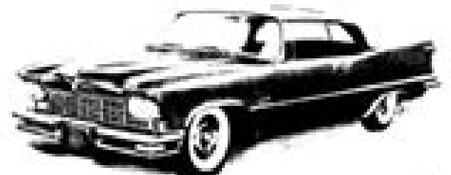
Fig. 3 - Model C-75-3 Imperial