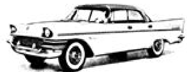
Fig. 2 - Model C-75-2 New Yorker