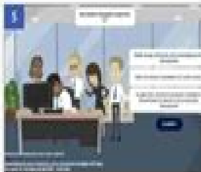
Shot size: Scene: