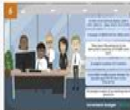
Shot size: Scene: