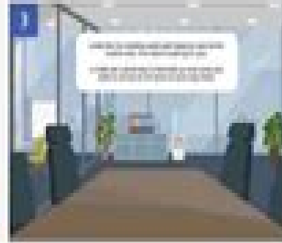
Shot size: Scene: