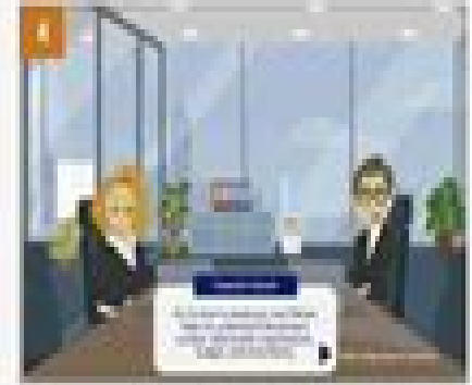
Shot size: Scene: