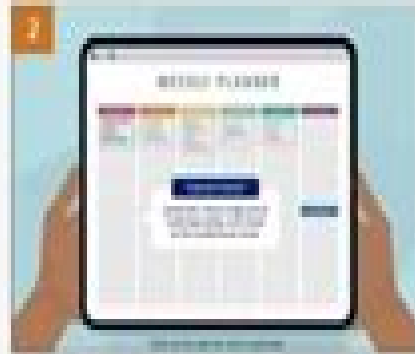
Shot size: Scene: