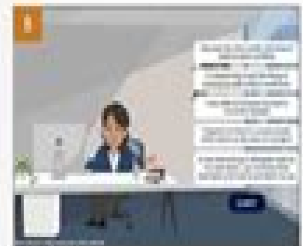
Shot size: Scene: