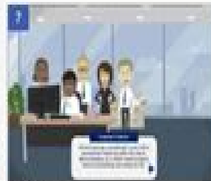
Shot size: Scene: