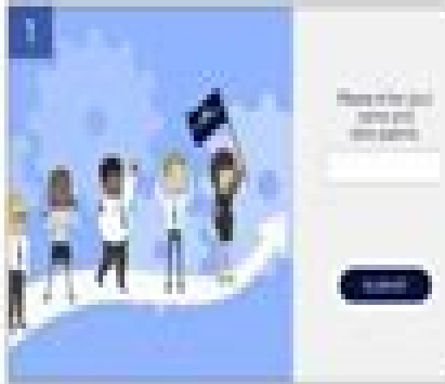
Shot size: Scene: