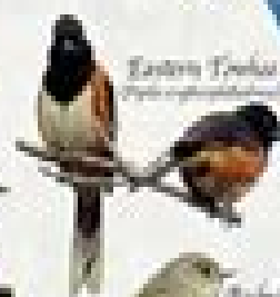
Eastern Towhee Spizella tolowee