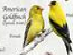
American Goldfinch Spinus tristis