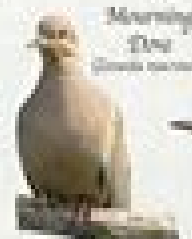
Mourning Dove Quercus morio