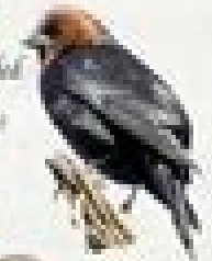
Brown-headed Cowbird Molothrus ater