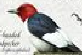
Red-headed Woodpecker Caprimulgus vociferans