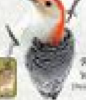
Red-bellied Woodpecker Geothlypis trichas