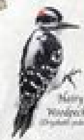
Hairy Woodpecker Dryobates pubescens