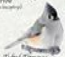
Tufted Titmouse Parus titorius