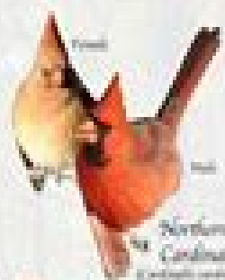
Northern Cardinal Cardinalis cardinalis