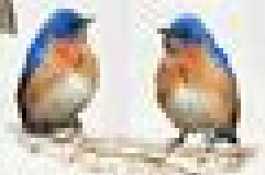
Eastern Bluebird Sialia sialis