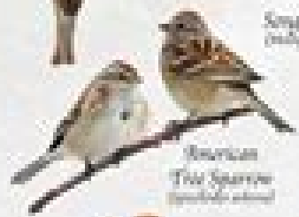
American Tree Sparrow Spizella arborea