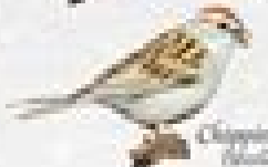
Chipping Sparrow Spizella socialis