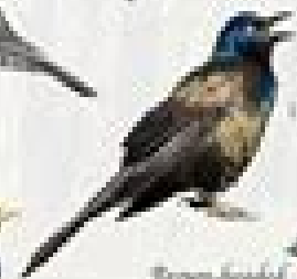
Common Grackle Quiscalus quiscula