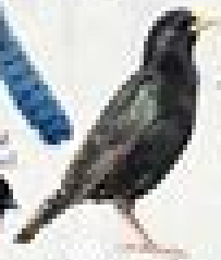
European Starling Sterna vulgaris