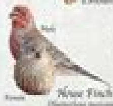
House Finch Monticola monticola