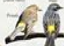
Yellow-rumped Warbler Geothlypis trichas