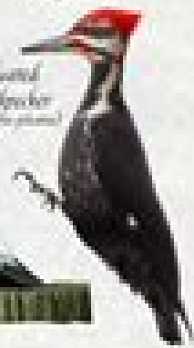
Pileated Woodpecker Dryobates pubescens