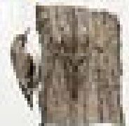
Brown Creeper Certhia americana