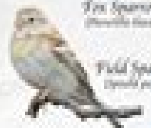
Field Sparrow Spizella pusillus