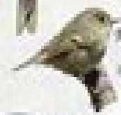
Ruby-crusted Kinglet Corynorhinus ruber