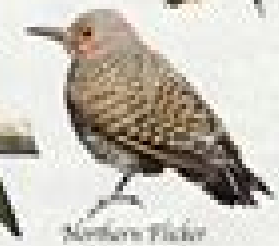
Northern Flicker Colaptes auratus