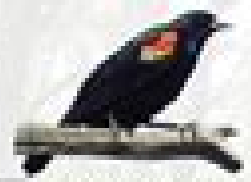
Red-winged Blackbird Aegialitis phoeniceus