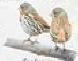
Fox Sparrow Passerella iliaca