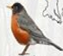
American Robin Merula migratoria