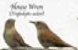
House Wren Troglodytes aedon