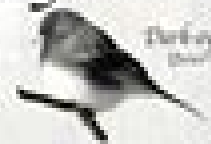
Dark-eyed Junco Junco hyemalis