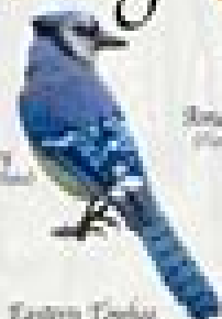
Blue Jay Cyanocitta cristata