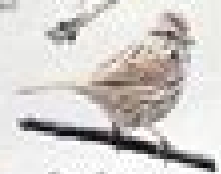
Song Sparrow Melospiza melodia