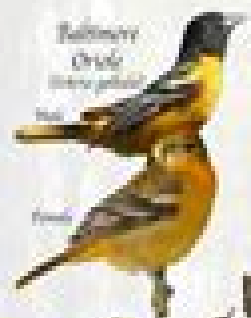
Baltimore Oriole Icterus galbula