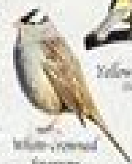
White-crowned Sparrow Zonotrichia leucophrys