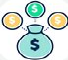
Debt Consolidation Loan