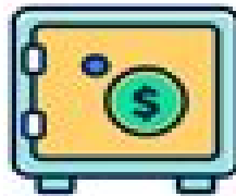
Savings / CD Loans