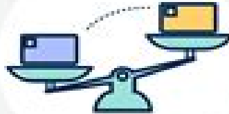
Credit Card Balance Transfer