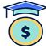
Student Loan Consolidation