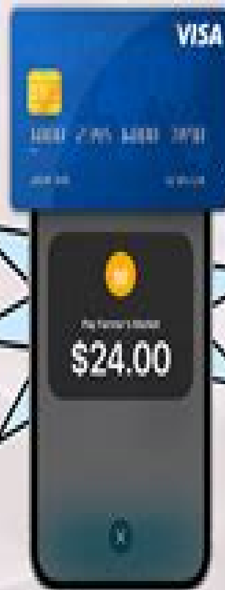
Tap to Pay