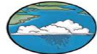
H = hydrosphere