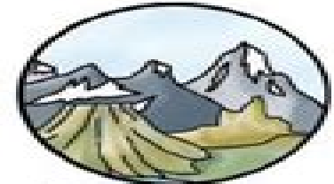
G = geosphere

Winds sweep across the deserts raising giant sandstorms that change the landscape.