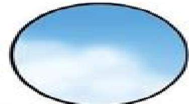
A = atmosphere