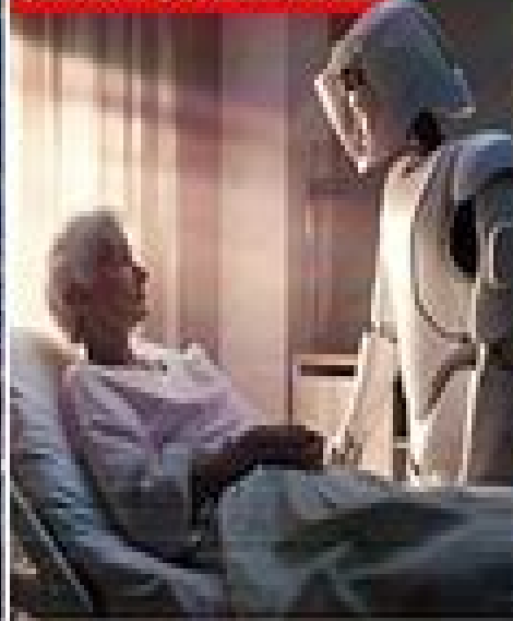
CARE FOR ELDERLY