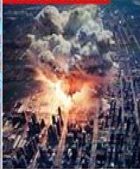
WIPE OUT HUMANS