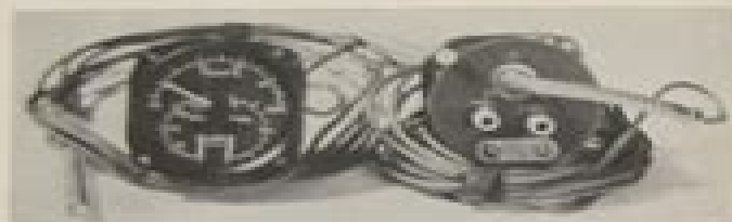
A. Speed unit.

65. Maintenance. —If any one of the three units of this page becomes inoperative, it is necessary to remove and replace the entire assembly. Maintenance procedure for the units in this page is the same as that described for individual pages.