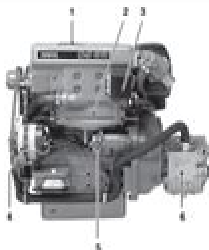
Co-10 A/B with reverse M/C20.