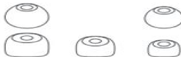
Ear tips * 5 [S / M / L]