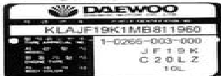
Fig. 2 Vehicle identification number(VIN) plate