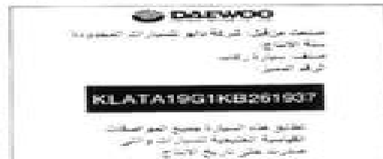
Fig. 5 G.C.C. conformity label