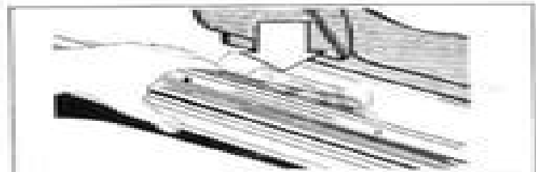
Fig. 4 Chassis number location