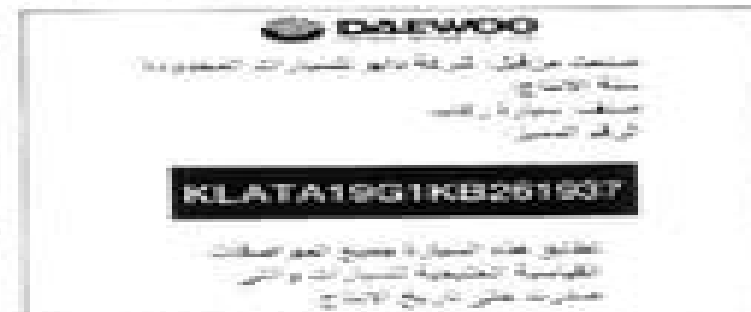
Fig. 5 G.C.C. conformity label