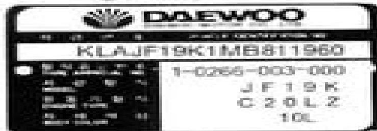
Fig. 2 Vehicle identification number(VIN) plate