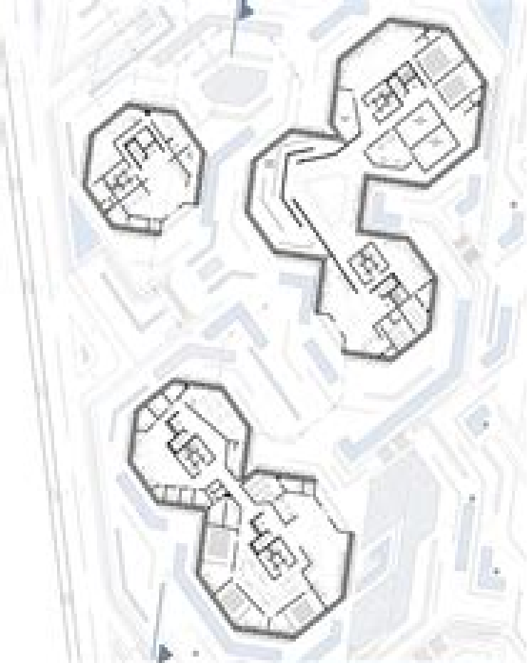
Brain Masterplan Scale 1:500