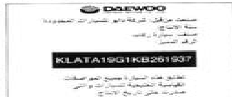
Fig. 5 G.C.C. conformity label