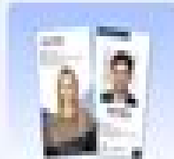
Photo Avatar Turn a photo into a talking avatar

Custom Avatar Create a personal avatar in minutes