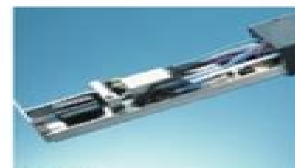
A-Series print head