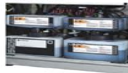
Unique Domino ink system