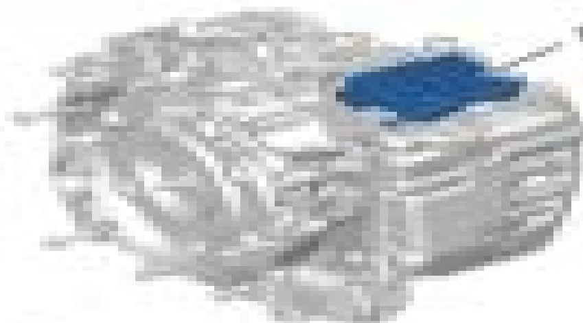
Figure 1: A 3D model of a grey, textured, rounded rectangular object with a blue, irregularly shaped patch on its top surface. A thin black line extends from the right side of the object.