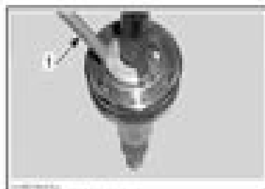
FIGURE 1-10 DRIVE BOOT 1. Drive boot (left)

With an hammer, hit on the tool to separate joint from shaft.