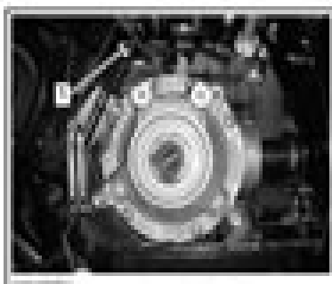
FIGURE 1-11 FRONT DIFFERENTIAL 1. Front differential