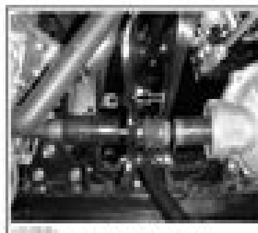
FIGURE 1-14 FRONT DIFFERENTIAL 1. Front differential