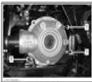
FIGURE 1-12 FRONT DIFFERENTIAL 1. Bolt securing front differential to frame