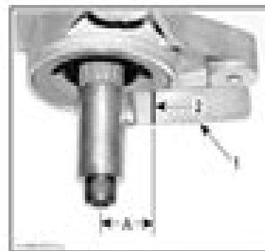
FIGURE 1-15 FRONT DIFFERENTIAL 1. Backlash measurement tool 2. Dial indicator 3. 25.4 mm (1 in)

From center of tool bolt, measure 25.4 mm (1 in) and scribe a mark on the flange.