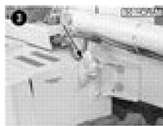
DEPOSITO HIDRAULICO FLUIDO TON DE CASE