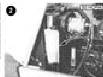
DEPOSITO DEL REFRIGERANTE ETILENGLICOL Y AGUA