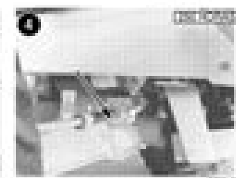
NIVEL DE ACEITE DEL EJE DELANTERO - TON HY TRAN FLUIDO DE CASE (MS1007)