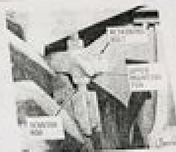
Tension Rod with Two Lock Nuts