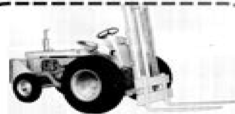
Figure 2 - Right Hand Front View Fork Lift