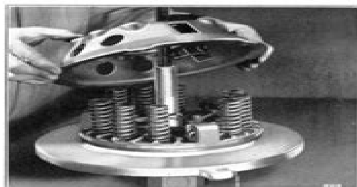
Fig. 64—Assembling Springs Note:—Models C-18 and C-19 have 12 springs and 4 release levers